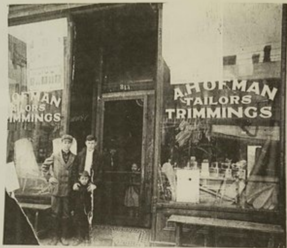
A CHICAGO PICTURE